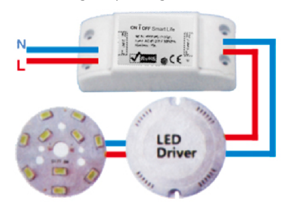
One wire wiring instruction